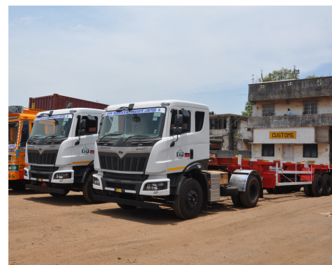
Single/ Double/ Triple Axle Trailers